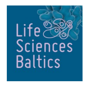
20th - 21st September 2023 LITEXPO, Vilnius, Lithuania

Life Sciences Baltics brings together top decision makers and the next generation of founders and talents from the Baltics, all in one place. They will be joined by CEOs of companies and startups, tech scouts and researchers from all around the world, to create a potential for deep cooperation across traditional boundaries