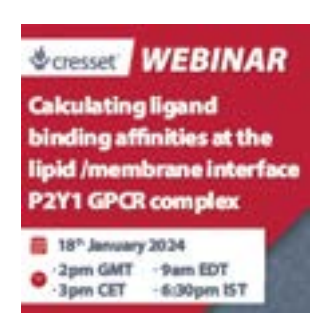
18th January 2024 Online

G protein-coupled receptors (GPCRs) are a very large and important class of drug targets. They are also a very difficult class in terms of modeling with adequate